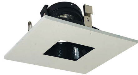
Shown in black reflector / white flange