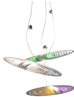
Shown in aluminum