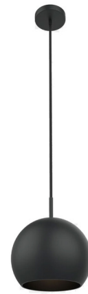
Shown in gunmetal