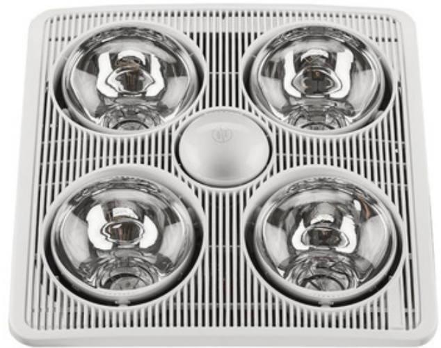
Shown in: White

The A716B Exhaust Fan with Heater and Light combines a low-noise bathroom ventilation fan with a powerful, efficient heater and a light, providing immediate warmth when you step out of the shower while quietly clearing excess moisture. Four anti-blast infrared heat lamps provide maximum warmth throughout the bathroom. Two or four lamps can be turned on for varying heat levels. The fan, heater and light may be wired separately, and a 4-function wall switch is included. The four heat lamp bulbs and a 60W incandescent light bulb are also included. This IC-rated fixture is suitable for new construction or remodel applications and fits with 2 x 8 inch joists. Articulating expandable anti-vibration brackets and a connector for 4 inch ducts are included. The fixture has rust-proof steel motor housing, a built-in backdraft damper and thermal shutoff. It cannot be installed directly over a tub or shower enclosure. UL listed when used with GFCI branch circuit wiring. Note: Requires a 15 amp circuit.