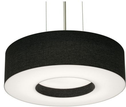
Shown in satin nickel / black / black