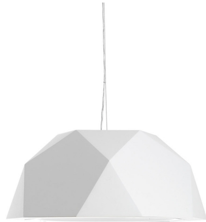
Shown in white / white

The Crio Pendant collection is designed for larger scale spaces. The collection is the result of the studies made by designer, Gio Minelli, on the polyhedrons of Archimedes and the techniques for producing aluminum sheeting, and his painstaking research to create a balance between shape and thought. The Crio is available in a painted aluminum or wood veneer over aluminum finish with an opaline PMMA diffuser. The 70.8 inch option is only available in White finish with integrated LED.