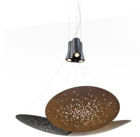
Shown in multicolor rust / bronze / iron