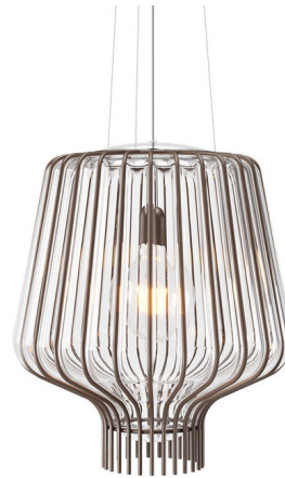
Shown in burnished / clear

Saya was inspired by the tale of a journey midway between the East and West, where aesthetics and the memory of far-off cultures are combined with Venetian tradition of cage blown glass to form these timeless pendants. Each element of the Saya pendant is hand crafted starting with iron rings forged into a structural cage around the upper and lower bases and then a burnished finish is applied by electroplating. The metal frame is then polished and passed to the expert glass blower.