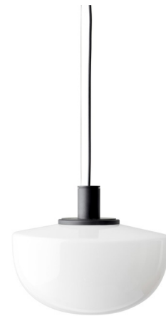
Shown in black / opal