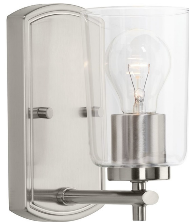
Shown in brushed nickel / clear

COLOR Clear BODY FINISH Brushed Nickel WATTAGE 8W DIMMER Standard 120V DIMENSIONS 4.5"W x 7.75"H x 6"D BULB NOT INCLUDED 1 x A19/Medium (E26)/8W/120V LED OTHER BULB OPTIONS 1 x A19/Medium (E26)/120V LED 1 x A19/Medium (E26)/60W/120V Incandescent COUNTRY OF ORIGIN China