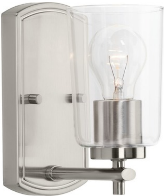
Shown in: Brushed Nickel / Clear

The Adley Wall Sconce has traditional styling with a modern twist making it a perfect choice for adding ambient lighting to your space. This simple yet sophisticated look make it welcome in baths, hallways, stairwells or entryways. The backplate features graceful, beveled detailing and is attached to a simple bar holding the Clear glass diffuser. Choice of Polished Nickel, Black, Brushed Nickel or Satin Brass finish. Fixture can be installed with the shade facing up or down. UL/CUL listed. Suitable for damp locations.