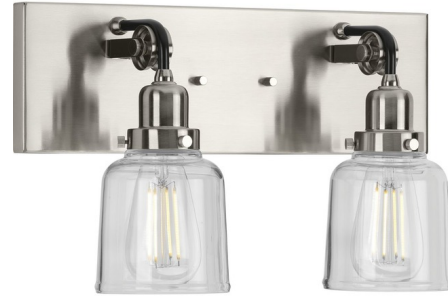
Shown in brushed nickel / clear

The Rushton Bathroom Vanity Light is a modern mixture of old and new. The antique styling makes it ideal for industrial and farmhouse decors. The backplate supports the charming pulley wheel which holds the antique-style socket. Clear glass shades highlights the bulbs for an extra pinch of vintage taste. Choose from all Brushed Nickel finish or Graphite with Antique Brass details. Ideally suited for vintage style bulbs.