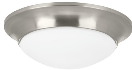
Shown in brushed nickel / etched glass

The Etched Ceiling Light Fixture will add a simple splash of sophistication while bringing glare free illumination to many different applications. Features an Etched glass diffuser with Brushed Nickel or Black finished out ring. Available in two sizes. cCSAus listed. Suitable for damp locations.