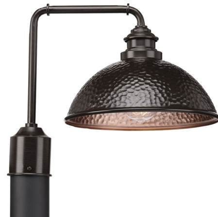
Shown in antique bronze

COLOR N/A BODY FINISH Antique Bronze WATTAGE 100W DIMMER Standard 120V DIMENSIONS 16"W x 13.44"H x 12"D BULB NOT INCLUDED 1 x Edison/Medium (E26)/100W/120V Incandescent OTHER BULB OPTIONS 1 x Edison/Medium (E26)/120V LED COUNTRY OF ORIGIN China