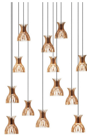
Shown in brown / natural wood

The Domita Multi Light Spider Pendant Light is a suspension of domed shades formed from curved wooden slats, offering a unique decorative element for interior spaces. The lights can be individually anchored with swag hooks to stagger their heights and space them into any desired arrangement. The Domita is suitable for residential and commercial applications, whether illuminating a dining room or retail display area, or featured as the dramatic centerpiece of a modern living room. Available in four sizes: 4-light (model S/20/4L), 7-light (S/20/7L), 13-light (S/20/13L) and 19-light (S/20/19L).