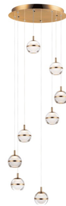
Shown in natural aged brass / clear / frosted

The Swank Multi Light Pendant features orbs of crystal Clear acrylic that are trimmed with a Polished Chrome or Natural Aged Brass band and Frosted inside for excellent light diffusion. The bottoms are dimpled for a unique optical effect. Available with three, five or eight lights. Includes 120 inches of field cuttable cords that are adjustable at of installation. Dimmable with LED compatible dimmer. ETL listed.