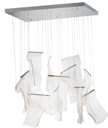
Shown in polished chrome / clear patterned acrylic

PRODUCT DIMENSIONS . . . . . Min/Max Overall Height: 19.25" – 135.5" LAMP LIFE . . . . . 50000 hours COLOR RENDERING . . . . . 90 CRI LAMP COLOR . . . . . 3000K LUMENS/WATT . . . . . 1,040.00 LUMINOUS FLUX . . . . . 2600 lumens