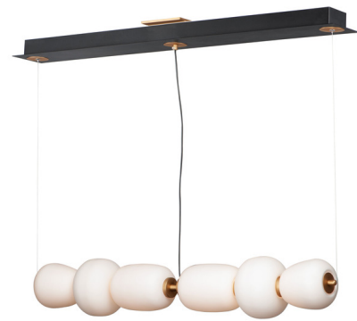
Shown in black / gold / satin white