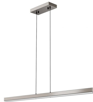
Shown in satin nickel / opal

COLOR RENDERING . . . . . 90 CRI LAMP COLOR . . . . . 3000K LUMENS/WATT . . . . . 75.18 LUMINOUS FLUX . . . . . 2932 lumens