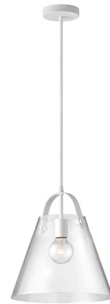
Shown in matte white / clear

PRODUCT DIMENSIONS . . . . . Max Overall Height: 54"