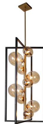
Shown in vintage bronze

PRODUCT DIMENSIONS . . . . . Fractional Rods: 8" + 11" + 20"