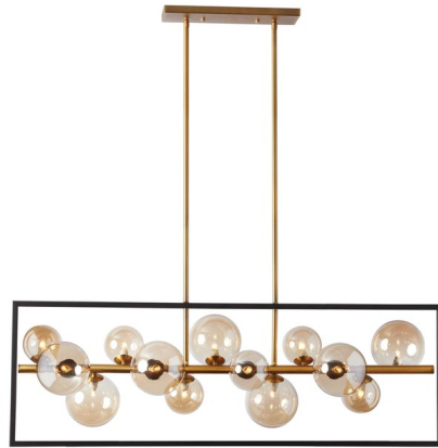
Shown in vintage bronze / matte black / champagne / champagne

The Glasgow Frame Linear Pendant utilizes geometric shapes and hard edges in order to create a truly unique piece of contemporary lighting. A set glass globes is surrounded by a metal square and drives the aesthetic behind the Glasgow. Place this pendant over the kitchen island or in a commercial space to heighten the ambiance. Note: Matte Black / Clear is only available with 10-Light option. Vintage Bronze / Matte Black / Champagne is only available with 13-Light option.