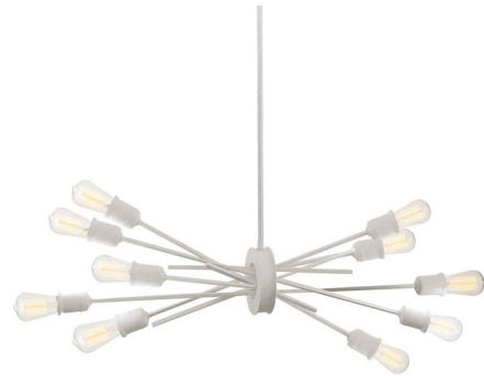
Shown in matte white

PRODUCT DIMENSIONS . . . . . Downrods Included: 1-8", 1-11" and 1-20" Stems