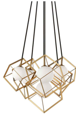
Shown in gold / white

The Thomson Pendant's modern design is a must-have for any contemporary space. Geometric shapes drive this fixture; by combining Gold finished metal cubes with a flawlessly clean Frosted Glass globe the design shines. Place the Thomson above a kitchen island or as an entryway statement piece.