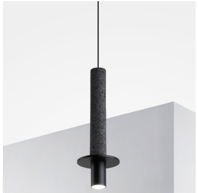
Shown in: Black / Black

The Meta Pendant is a timeless piece made from organic materials and coated aluminium. Both materials are formed into cylindrical shapes emphasizing a sleek aesthetic with a monochromatic palette of tones. It is sculpture on its own as well as a light architecture. Dark toned nuances enclose the warm light that strikes the surface below. Available in volcanic rock with a Black shade, fiorito rock with a powder-coated Aluminum shade, or red travertino rock with a Copper shade. Black canopy: 4 inch diameter. Handcrafted in Mexico. CE listed.