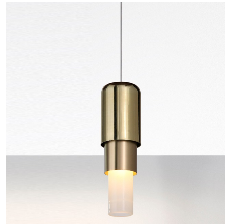
Shown in brass