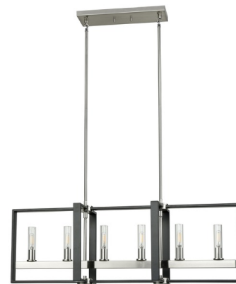
Shown in satin nickel / graphite / clear

The Blairmore Linear Pendant offers bold styling, designed to be modern, sleek and rigid. This fixture is available in three amazing finishes to suit different aesthetic needs. Includes Clear glass diffusers and 40 inch downrods. ETL listed.