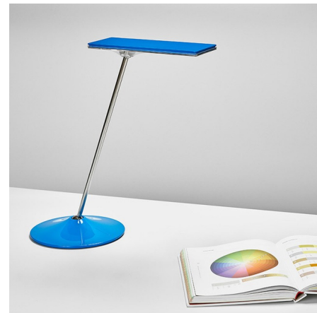
Shown in twilight blue

The Horizon 2.0 Table Lamp has many talking points to claim and is suitable for the most discerning spaces. This beautifully designed lamp received a Red Dot Award and the Next Generation Luminaries Award for product design and performance, and has been accepted into the permanent collection of the Museum of Modern Art and Cooper Hewitt, Smithsonian Design Institute. This visually striking table or desk lamp offers glare free, even light. Features thin film LED technology, that dims from full brightness to nightlight levels. The precision brass ball joints allow for effortless adjustment. Includes manufactures 10 year warranty. Energy Star quantified.