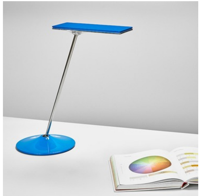
Shown in: Twilight Blue

The Horizon 2.0 Table Lamp has many talking points to claim and is suitable for the most discerning spaces. This beautifully designed lamp received a Red Dot Award and the Next Generation Luminaries Award for product design and performance, and has been accepted into the permanent collection of the Museum of Modern Art and Cooper Hewitt, Smithsonian Design Institute. This visually striking table or desk lamp offers glare free, even light. Features thin film LED technology, that dims from full brightness to nightlight levels. The precision brass ball joints allow for effortless adjustment. Choose from Twilight Blue, Arctic White, Morning Pink, Jet Black, Matte Silver and Bronze Gold finish. Includes manufactures 10 year warranty. Energy Star quantified.