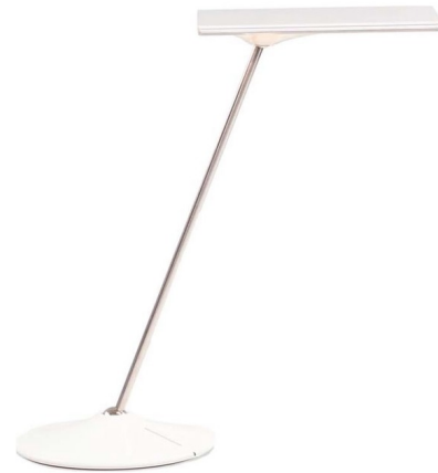
Shown in artic white

The Horizon 2.0 Table Lamp has many talking points to claim and is suitable for the most discerning spaces. This beautifully designed lamp received a Red Dot Award and the Next Generation Luminaries Award for product design and performance, and has been accepted into the permanent collection of the Museum of Modern Art and Cooper Hewitt, Smithsonian Design Institute. This visually striking table or desk lamp offers glare free, even light. Features thin film LED technology, that dims from full brightness to nightlight levels. The precision brass ball joints allow for effortless adjustment. Includes manufactures 10 year warranty. Energy Star quantified.