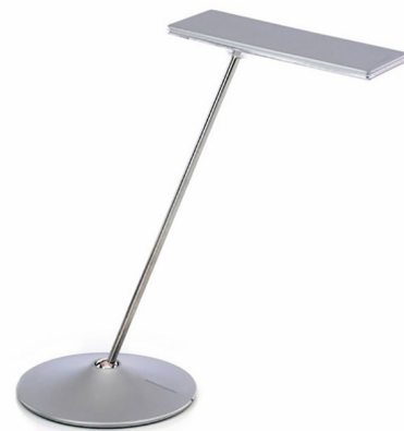
Shown in matte silver

LAMP LIFE 50000 hours COLOR RENDERING 92 CRI LAMP COLOR 3000K