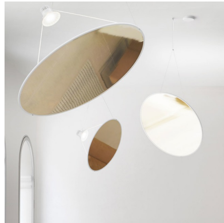
Shown in gold