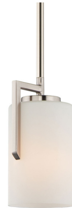
Shown in satin nickel / satin white

The Dart Pendant is a Modernist inspired scone that features a Satin White glass cylinder to drive home the clean and modern look. The steel frame utilizes a dramatic angle and simple geometry that is popular in Modernist work. This versatile pendant can even be installed on a sloped ceiling. Dimmable via Triac or electronic low voltage (ELV) dimming.