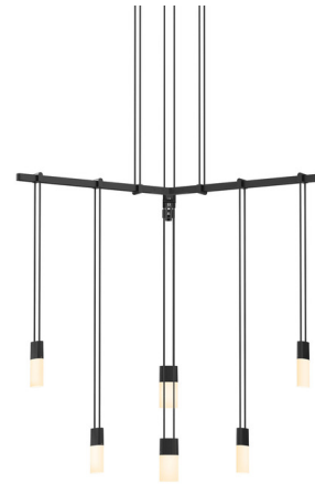
Shown in satin black / etched chiclet

PRODUCT DIMENSIONS . . . . . Overall Height: 22" min / 40" max COLOR RENDERING . . . . . 90 CRI LAMP COLOR . . . . . 3000K LUMENS/WATT . . . . . 345.00 LUMINOUS FLUX . . . . . 690 lumens