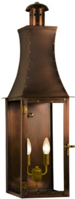
Shown in: Antique Copper / Clear

The Churchill Outdoor Flush Wall Light's shape towers up like an industrial smoke stack. Constructed of Copper, the Churchill pays homage to the traditional lantern design with its frame and Clear Glass panes. Place the Churchill anywhere where a touch of classicism is needed.