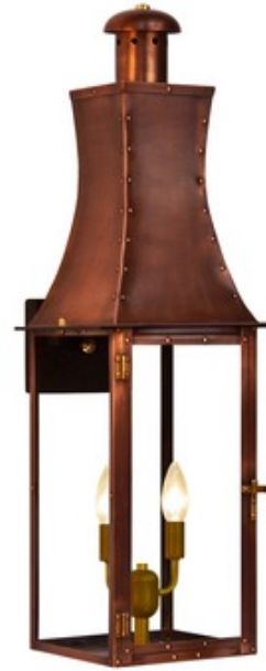
Shown in: Antique Copper / Clear

The Churchill Outdoor Wall Light's shape towers up like an industrial smoke stack. Constructed of Copper, the Churchill pays homage to the traditional lantern design with its frame and clear glass panes. Place the Churchill anywhere where a touch of classicism is needed.