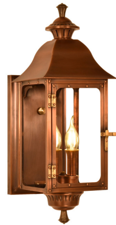
Shown in antique copper / clear

The Antler Hill Outdoor Wall Light's elegant design is a warm welcome to those who appreciate timeless style. Constructed of Copper, the Antler Hill features Brass details that perfectly contrast against the Copper frame. Panes of clear glass add protection and give a window into the inner workings of this fixture. Flank your garage or light up the entryway with the regal Antler Hill.