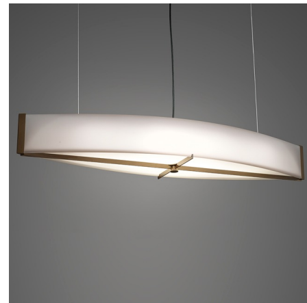
Shown in medieval bronze / opal

The Ellipse Wide Tapered Pendant is a clean detailed piece, perfect in a variety of spaces in your home. The curved Opal acrylic diffusers are available in White Swirl, Caramel Onyx, Tea Stained, Faux Alabaster, or Opal and held by a decorative frame in Medieval Bronze, Bronze Age, Black, Cast Bronze, Black Pearl, Chestnut, Chrome, Dark Iron, Empire Bronze, New Brass, Smokey Brass, Satin Pewter, or Smoked Silver. Canopy: 28 inch x 6 inch rectangle. Damp location rated. Made in the USA. UL listed.