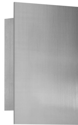
Shown in marine grade brushed stainless steel