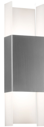
Shown in marine grade brushed stainless steel