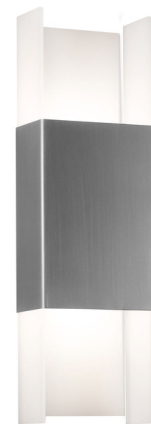
Shown in marine grade brushed stainless steel

COLOR RENDERING . . . . . 90 CRI LAMP COLOR . . . . . 4000K LUMENS/WATT . . . . . 80.71 LUMINOUS FLUX . . . . . 1130 lumens