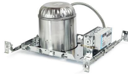
Shown in aluminum

The Cobalt 6 Inch New Construction Non-IC Housing is constructed of one piece aluminum and allows for adjustable ceiling thickness from .50 to 1.25 inch. Non-IC housings require a minimum clearance of 3 inches from thermal insulation. 120 volt input with 30 watt LED driver (2000 lumens) and 0-10V dimming option. UL listed for wet locations. Energy Star. Meets or exceeds ASTM-283 Air-Tight requirements. Note: A complete fixture includes a housing and trim, sold separately.