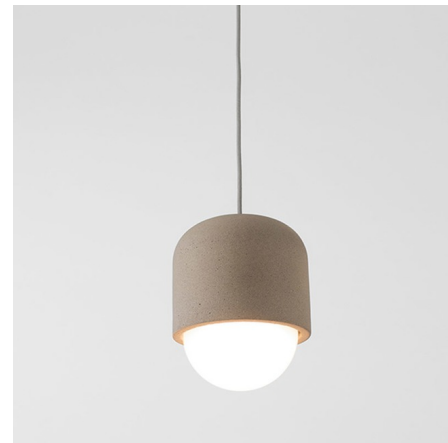
Shown in concrete / opal

PRODUCT DIMENSIONS . . . . . Maximum OAH: 78.7" COLOR RENDERING . . . . . 90 CRI LAMP COLOR . . . . . 2700K LUMENS/WATT . . . . . 110.00 LUMINOUS FLUX . . . . . 550 lumens