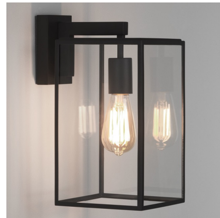
Shown in textured black / clear

The Box Lantern Outdoor Wall Sconce is a timeless piece, perfect in a variety of exterior spaces. The Clear glass panels are held by a box frame in Textured Black. Available in two sizes. Mounts to standard 4 inch octagon box. Wet location rated. ETL listed.