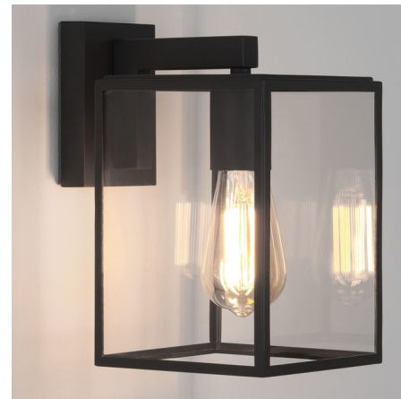
Shown in textured black / clear

The Box Lantern Outdoor Wall Sconce is a timeless piece, perfect in a variety of exterior spaces. The Clear glass panels are held by a box frame in Textured Black. Available in two sizes. Mounts to standard 4 inch octagon box. Wet location rated. ETL listed.