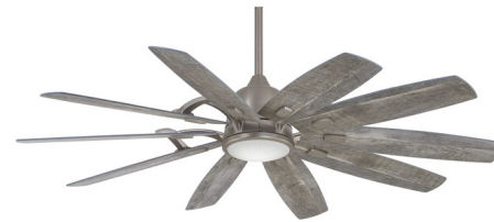
Shown in burnished nickel / savannah grey

LAMP LIFE . . . . . 30000 hours COLOR RENDERING . . . . . 94 CRI LAMP COLOR . . . . . 3000K LUMENS/WATT . . . . . 49.60 LUMINOUS FLUX . . . . . 1984 lumens