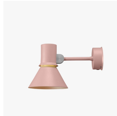
Shown in rose pink

The Type 80 Wall Sconce was designed by the renowned British industrial product designer, Sir Kenneth Grange. This clean and contemporary wall sconce is distinguished and features an attractive 'halo' of light that escapes from the conical shade, adding an extra dimension in low light environments. The streamlined styling and variety of colors make this a versatile fixture that will work with many decors. Choose from Matte Black, Pistachio Green, Grey Mist or Rose Pink finish. On/off switch located on the shade. Includes a junction box mounting kit - .26 inch depth x 5.8 inch diameter. UL listed.