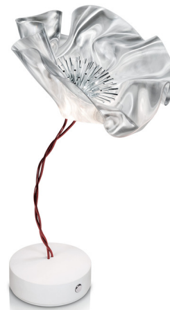
Shown in copper / prisma

LAMP COLOR 2700K LUMENS/WATT 115.38 LUMINOUS FLUX 150 lumens