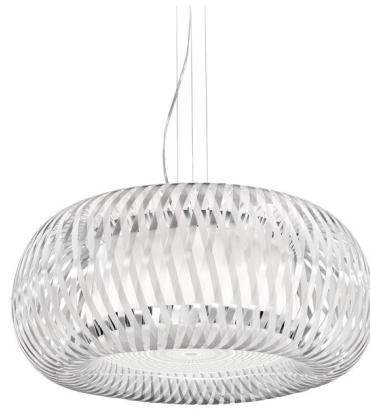
Shown in white / prisma