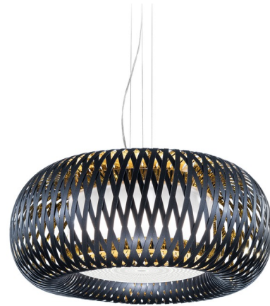
Shown in black / black / gold

PRODUCT DIMENSIONS . . . . . Cord Length: 55"