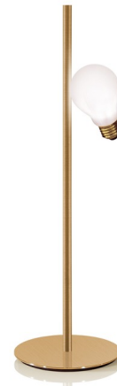
Shown in brass / white

The Idea Table Lamp, designed by Marcantonio, strips away design, leaving the essence of light, a three-dimensional bulb and a brass-finish screw base, magically suspended on a stem of Brass. Plays on the unexpected, ironic effect of an idea popping up when, and where, you least expect it. CE listed.