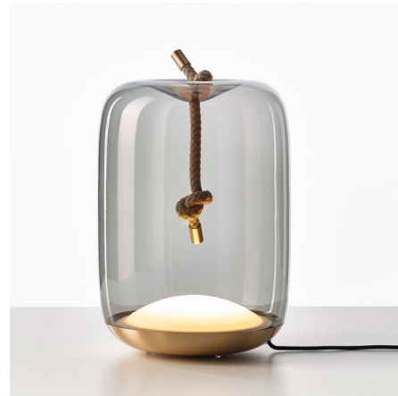
Shown in brass / transparent smoke grey

The Knot Table Lamp combines coarse natural fibers with smooth glass to create a striking contrast. An LED light source is housed in a refined metal base. Available in Transparent Smoke Grey, Transparent Smoke Brown, Opaline, or Transparent glass with a Chrome, Brass, Brushed Stainless, or Black Chrome base.