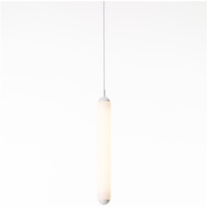
Shown in: Matte White / Triplex Opal

The Puro Solo Vertical Pendant offers a simple, yet striking design that will tie into a number of interiors with its minimalist nature, suspended solo or in multiples. Named for the Spanish word for cigar, the pendant embodies that with its sleek cylindrical form that curves on the top and bottom, with the body of the light serving as the diffuser for a soft ambient light. NOTE: Cord Length must be specified upon ordering and is not field-adjustable. Please contact our sales team.